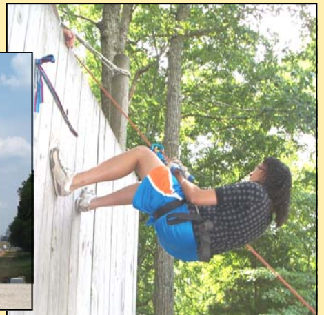
Tiara rappelling at camp in July