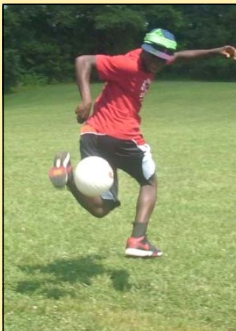
Mentoe at camp in July